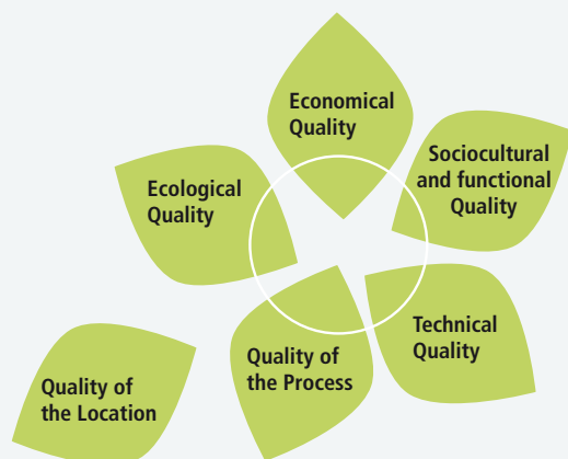
DGNB Certificate: the six areas of evaluation

As a clear and easily comprehensible rating system, the certificate covers all relevant fields of sustainable building and distinguishes outstanding buildings in gold, silver and bronze. Six areas of evaluation are singled out in the assessment: ecology, economy, socio-cultural and functional aspects, techniques, processes and location. The location is reported separately.