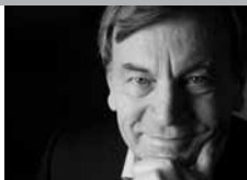
Prof. Manfred Hegger Chairman of the German Sustainable Building Council

“Modern cities and their buildings are potential mines for future generations. A good and comprehensive planning and evaluation of buildings is essential to ensure the accessibility to these ‘urban mines’ in the future. Metals play a particularly important role in this context due to their good recyclability which saves resources and can safeguard a sustainable supply of raw materials for the future. This approach is also embedded in the DGNB certification system, which takes into account end-of-life recycling.”